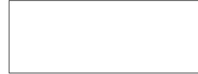
WHITE – 47-700