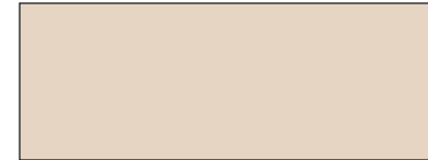
BUFF BEIGE – 47-706